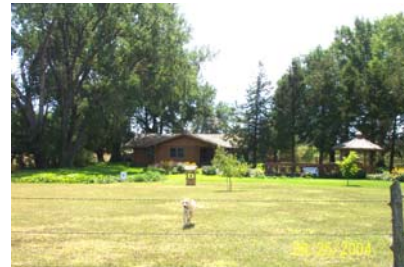
County: Larry & Linda Montross at 9386 East State Farm Road