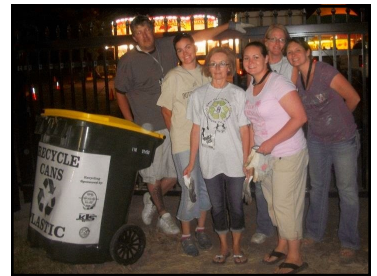
Cans For Critters

Nebraskaland Days went Green in 2012! And they called on KNPLCB to make it happen. Yellow-lidded bins, provided by the city of North Platte, were placed around the arena during Rodeos and concerts. Groups then volunteered to sort and bag materials in