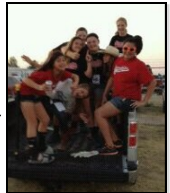
Bandits 12U Softball

We hope more people will be aware of the yellow-lidded bins next year and help us continue our efforts to keep aluminum out of the landfills!