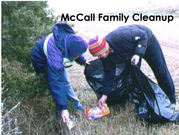
McCall Family Cleanup