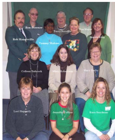
Staff & Board Members

grant award was in the amount of $44,623.00, to cover operational, staff, and programming costs. KNPLCB also received funding to continue its work on increasing participation in local recycling opportunities. The group will continue its 'Don't Be a Tosser' advertising campaign, assist with subsidization and management of the 24 hour recycling trailers, and work to turn local events into 'Green Events' by providing extra trash and recycling receptacles for use. The group's recycling program was awarded $20,634.00. The organization's final award was in the Cleanup category for $15,000.00. The 2007 Cleanup program will continue to see volunteers removing litter and debris from Lincoln County roadways, river banks, park systems, trails, and Interstate lake systems. The Cleanup program is complementary to the educational programming from KNPLCB staff. The Cleanup program provides volunteer organizations and families the opportunity to raise funds for their activities while giving of their time, energy, fuel, and equipment. The groups clear litter from their assigned areas every spring and fall. The Cleanup program also seeks to engage community groups in cleaning up