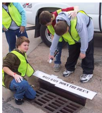
Students from the Green Team stenciled roughly 15 storm drains near Madison Middle School.