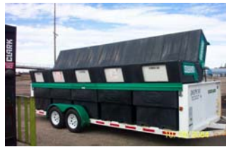
One of KNPLCB's 3, 24-hr. recycling trailer gets emptied. Trailers are emptied by volunteers around once a week.

baler, three recycling trailers, and other items for the program. KNPLCB also provides educational & promotional materials to